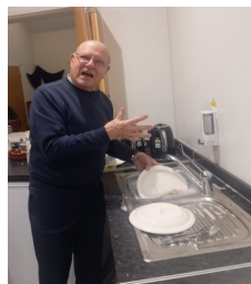
A few photos of the event

Please could residents book their place on the Coach Trips 2 weeks in advance to allow for ticket allocation