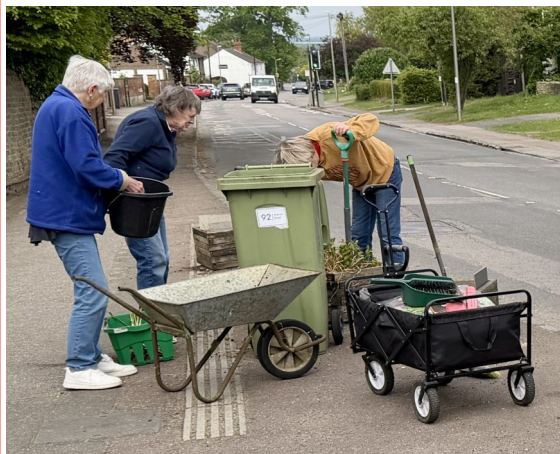
Here are some of our volunteers hard at work tending the planters

A big thank you to all who help to keep these planters around our village cared for and watered (not an easy task). They make the entrances and surrounds to our village a colourful and welcoming site