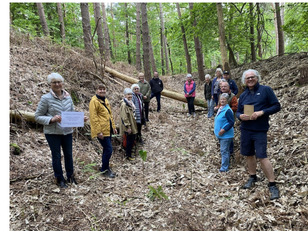
The photograph shows us flanking the exact location of the excavation site

Bow Brickhill History Society felt that the centenary of this work should be recognised and therefore a group of members met at the dig site on 29th May 2024 to commemorate the work.